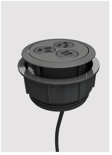
* Image shown: 2 Power, 1 USB configuration with a Soft Touch Molded Black Plastic with Black simplexes