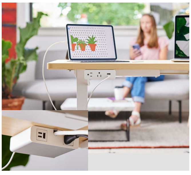
* Image Shown: 5 port Finch unit with 2 Power, 1 USB A+C in front, 1 Power, 1 Dual USB-C+A in the rear, with an Under Mount

With smooth lines, and a gently curved aluminum extrusion, it is both modern and warm, unfussy and unassuming. Offered in a calming palette of new naturals, our Finch is beautifully at home in any working space.