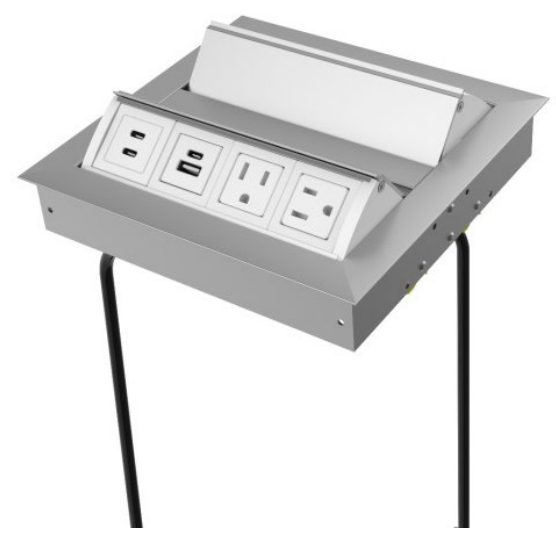
^{\ast} Image shown: 2 Power, 1 Dual USB-A+C, and 1 Dual USB-C 45W on each side