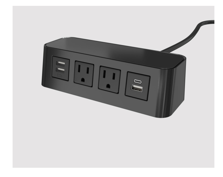
* Image shown: 2 Power, 1 dual USB and 1 USB A+C configuration with Gloss Black