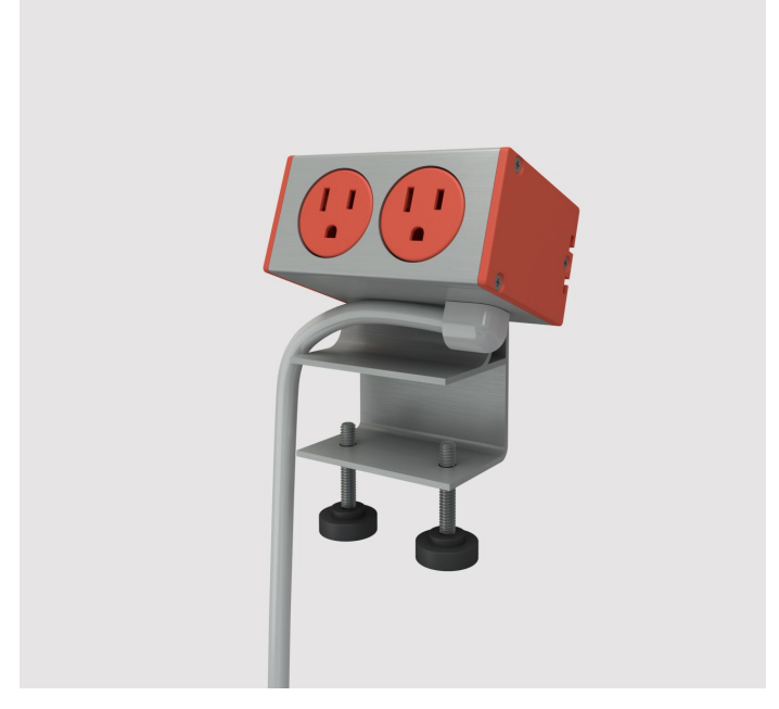
^{\star} image shown: 2 Window Dot unit with 2 Power, with Clear Anodized Aluminum, and Poppy Plastic.